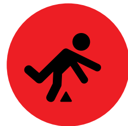
Slips, trips and fall