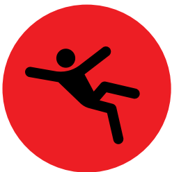
Falls from heights

The dynamic setting of construction sites presents various risks that can threaten worker safety and project integrity. By understanding and managing these risks, we can foster a safer working environment.