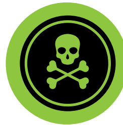
Exposure to hazardous substances